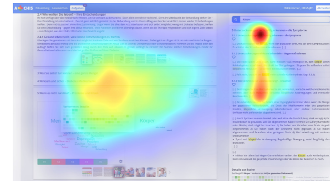
Saliency Map of Mouse Positions of on selected task of the GUID/ETA dataset.

Open tasks include the implementation of overview visualizations for cohorts of users/IR tasks in an existing prototype [2] and classification of behavioral patterns at different frequencies.